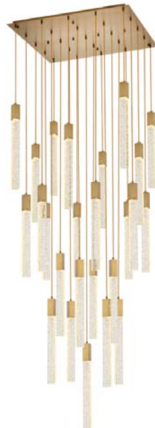
Stain Gold Item No: 2066G36SG