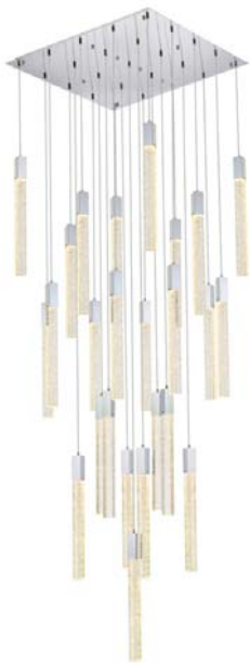
Chrome Item No: 2066G36C